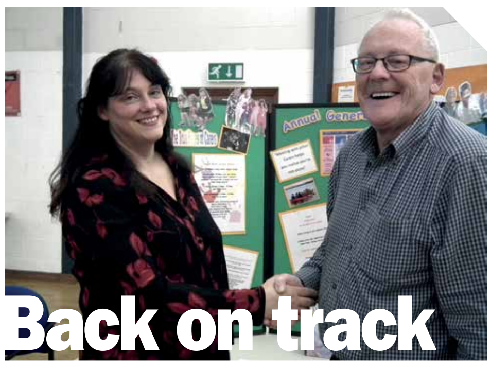
After turbulent times things are looking up for North West Carers

NORTH WEST CARERS CENTRE has had it's share of difficulties over the last year: without a manager and facing a funding crisis, there were times when the voluntary board and staff must have thought about throwing in the towel. Thankfully they remained loyal to the project, however, and their recent annual general meeting heard that the Carers Centre is still very much alive and kicking!