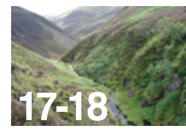
Sites of Special Scientific Interest