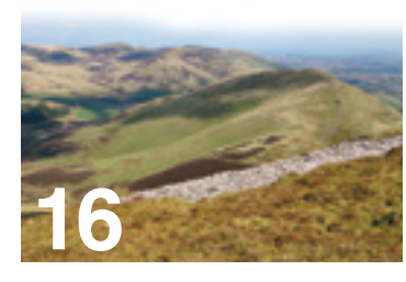
Pentland path survey