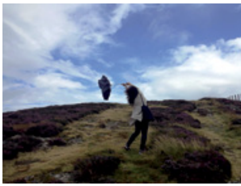
Benjamin Panulo 'Amira 2'