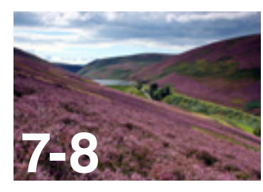
Moorlands and the Red Grouse