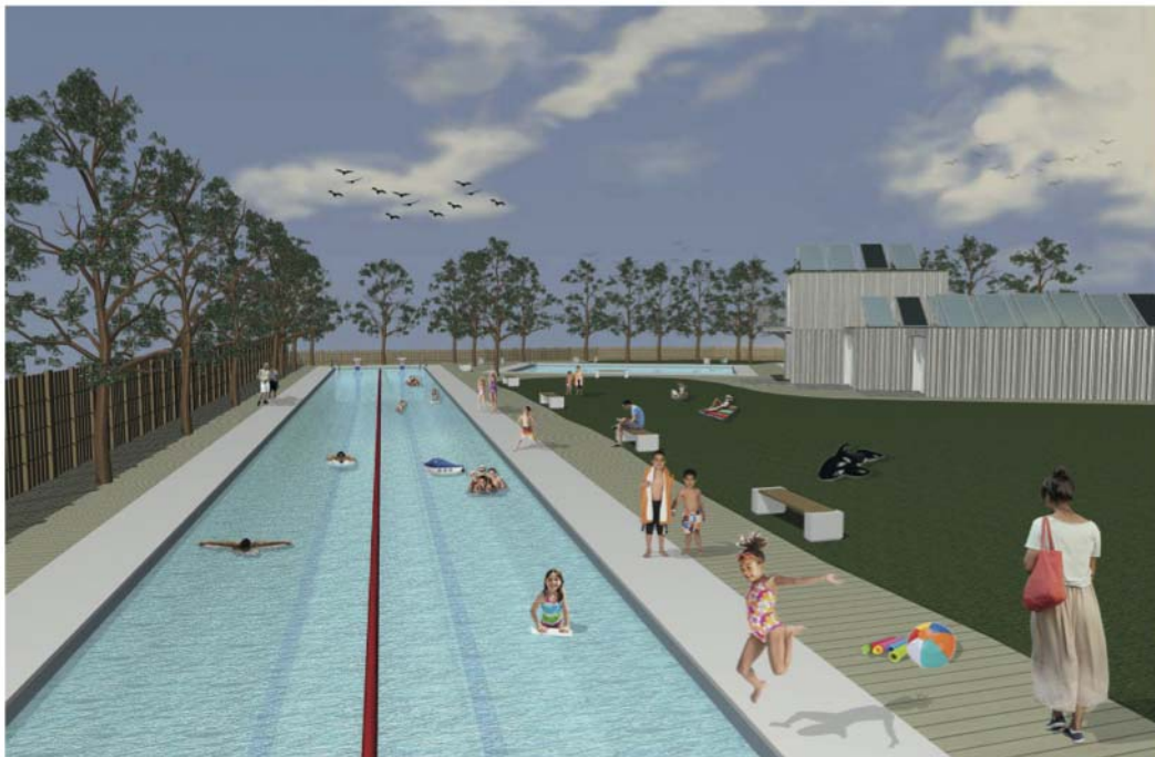
3. LIDO 50m Olympic Training Lengths, Fun Pool with Changing Rooms & Cafe