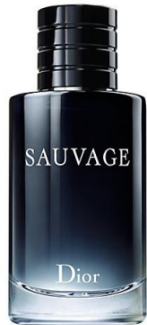
Dior Sauvage Spray Eau de Toilette, 100 ml, £67.50

John Lewis Edinburgh has everything you need to help you find the ideal gift for your loved one this Valentine's Day. From gadgets, to grooming accessories, choose from a wide selection of men's gifts to let that someone special know you're thinking of them.