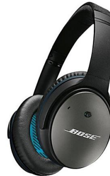
BOSE QuietComfort Noise Cancelling QC25 Over-Ear Headphones, £269.95