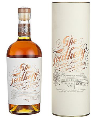
Edinburgh Gin The Feathery Malt Scotch Whisky, 75cl, £50