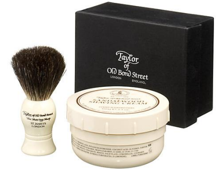
Taylor of Old Bond Street Shaving Set, £32