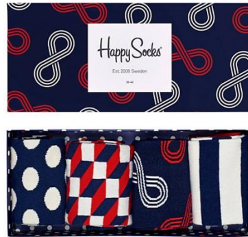
Happy Socks Big Dot Gift Box, Pack of 4, £25