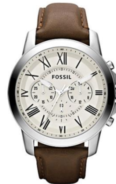
Fossil Grant Chronograph Leather Strap Watch, £105