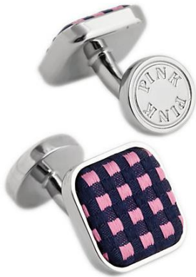
Thomas Pink Warren Woven Button Cuff Links, £25