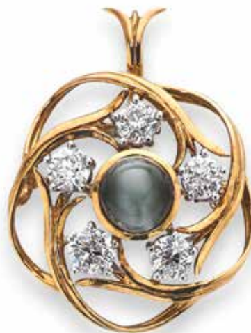
(enlarged image of lot 184)