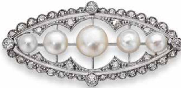
(enlarged image of lot 75)