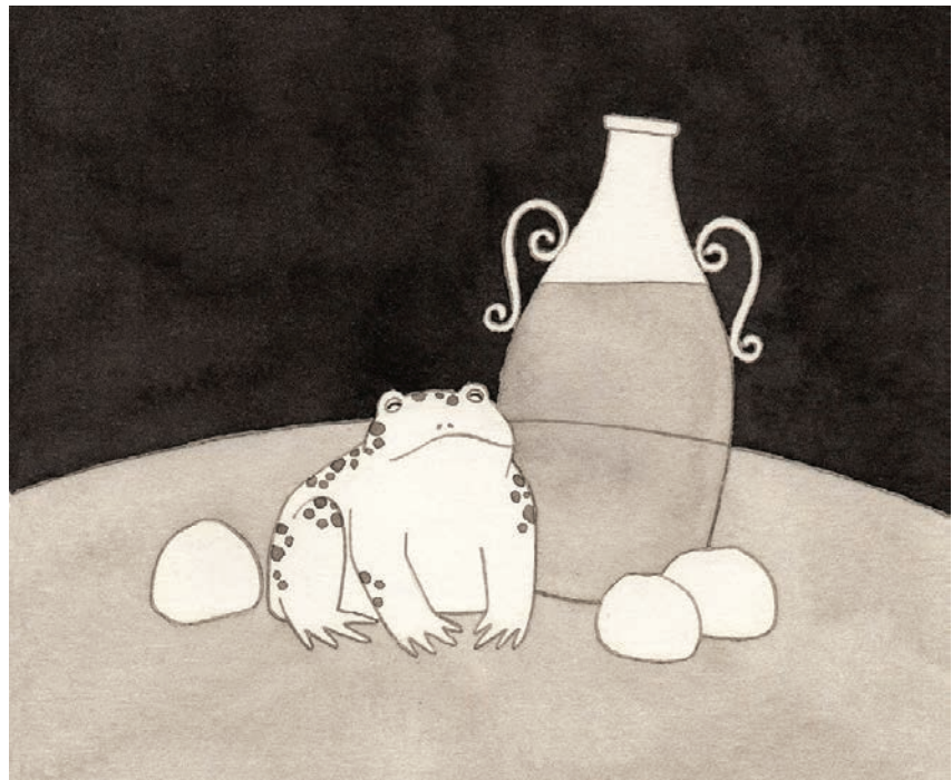
STORIE DI TERRA