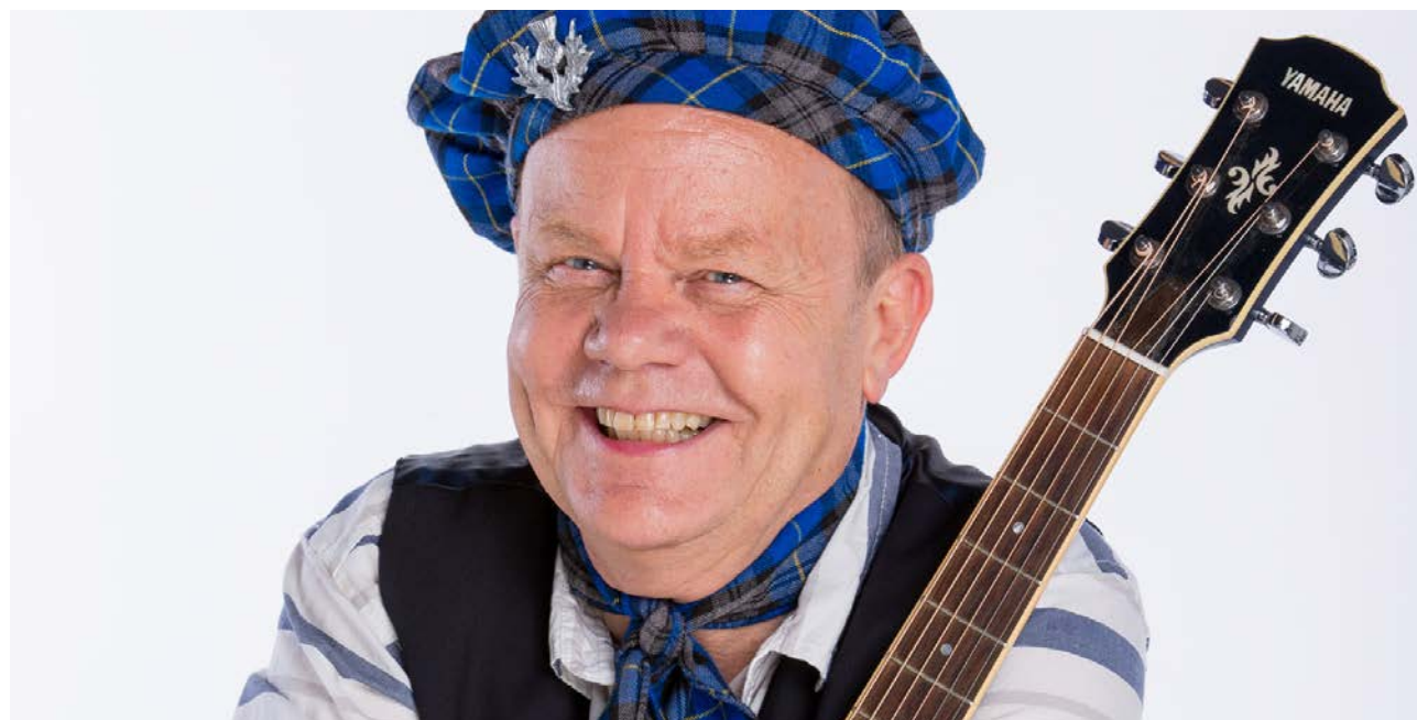
ARTIE'S TARTAN TALES