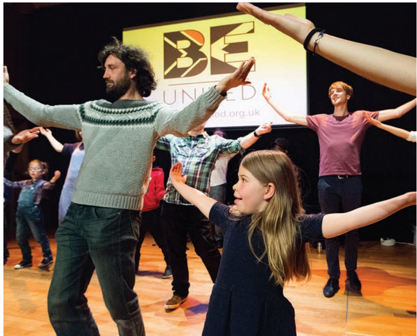
NATIONS UNITED