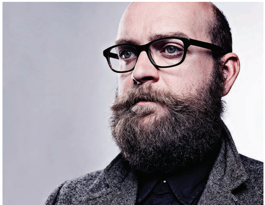
FINDLAY NAPIER - PHOTO BY DAVID BONI