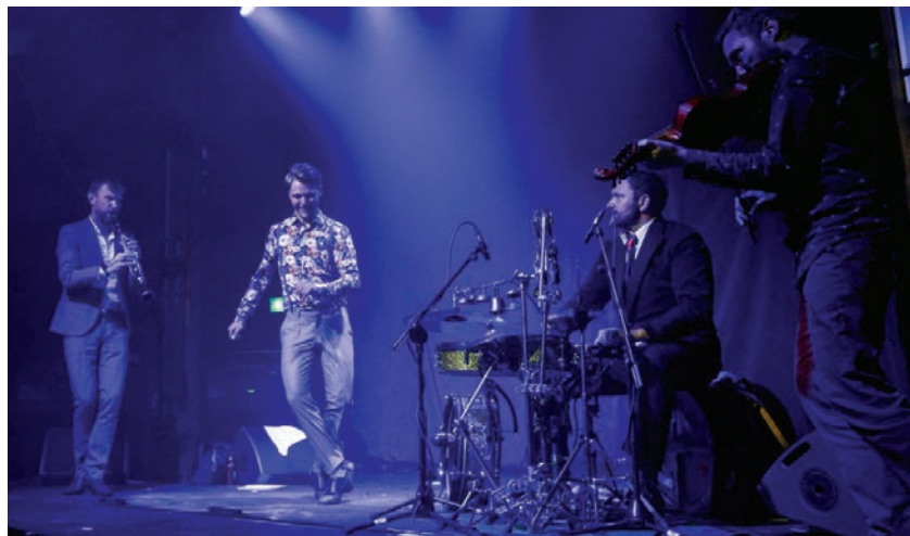
THIS IS HOW WE FLY