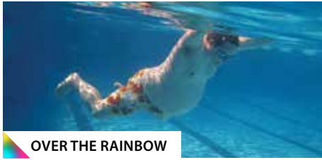
OVER THE RAINBOW